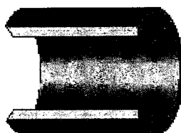
A normal artery allows blood to flow through easily.

Plaque buildup can lead to cardiovascular disease, stroke and aneurysms.